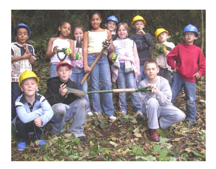
Children planting trees at volunteers' open day

Carrs Woodland is a joint project between local residents, Bath & North East Somerset Council, Wildspaces, Envolve and Newton Mill Camping Park. The project is led by the Carrs Woodland Forum, a group of local people who look after the site and run various events and activities.